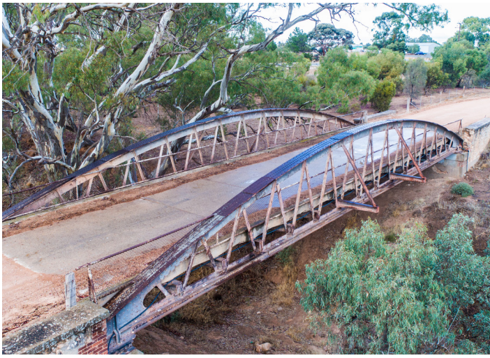
The heritage listed Dunn's Bridge in Balaklava.