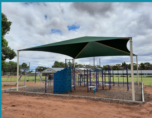
Blyth playground's new shade sail.

Owen swimming pool works have also begun with the pool being emptied of all its water ready for demolition works to begin in the coming months.