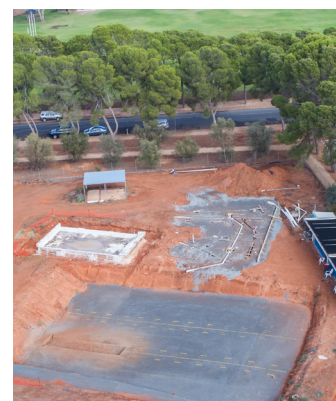
Works at the Balaklava Swimming pool are continuing, with the splash pad base laid.

deck system, the original scum gutters from the learn to swim pool have also been removed.