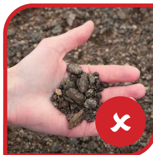
Dirt, rocks, bricks & pavers