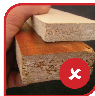
Laminated or veneered materials