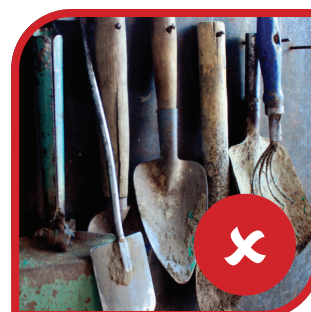
Garden hose & tools