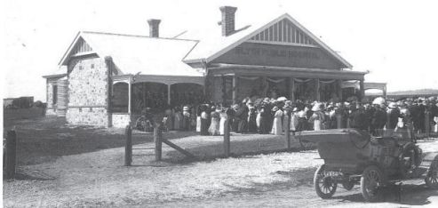
The Official Opening of the Blyth Public Hospital, 1911.