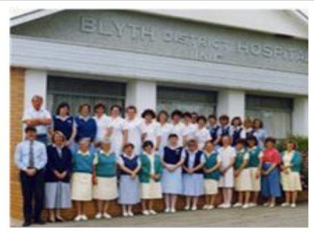
Blyth Hospital Staff Photo 1991