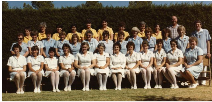
Blyth Hospital Staff Photo 1986