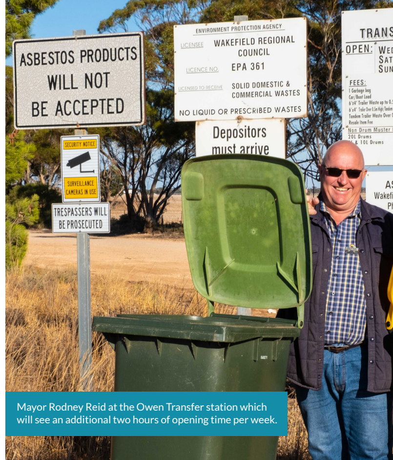
Mayor Rodney Reid at the Owen Transfer station which will see an additional two hours of opening time per week.

Enjoy this edition of the Wrap, Mayor, Rodney Reid